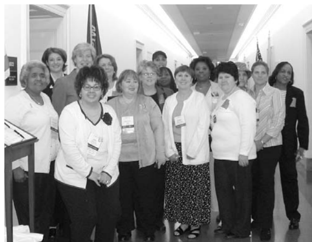
The WBCC delegation with Congresswoman Tammy Baldwin outside her office.