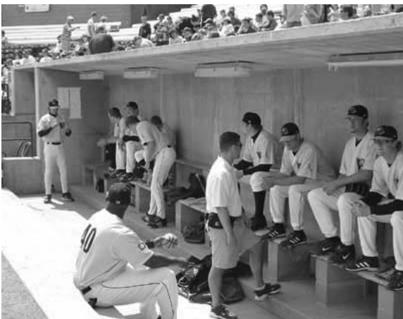
Wisconsin Timber Rattlers wearing pink uniforms to promote breast cancer awareness.

Thank you to the Wisconsin Timber Rattlers for hosting the event—one that they hope to continue as an annual tradition.