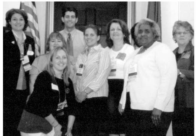
WBCC Members along with our special guest from the U.K. with Congressman Paul Ryan outside his office.

If you are not yet a member, or your membership has lapsed and would like to join us again, please fill in the information on the back cover and mail it to WBCC. Join our collective voice and make a difference.