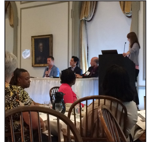
WCC regional meeting in Milwaukee

WBCC shares several policy priorities with the WCC, among them increasing the quality, availability, and effective use of health insurance coverage for cancer prevention and treatment, and protecting funding for cancer prevention and control.