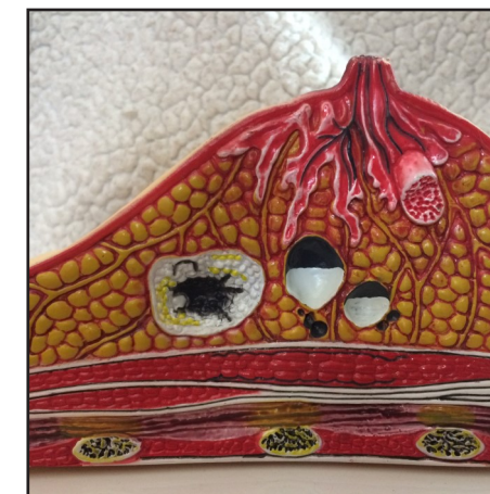
Cross-section model of cancerous breast

For women with little or no access to insurance, the Wisconsin Well Woman Program is supposed to provide cervical and breast cancer screenings at no costs to women aged 45 to 64. But women in Wisconsin are vulnerable, because the 2015 restructuring of the Wisconsin Well Woman Program (WWWP) and now attacks on the Affordable Care Act (ACA) have left women out in the cold.