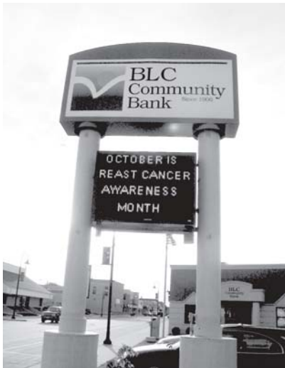
BLC Community Bank raises money for WBCC

Another of our esteemed annual corporate contributors is BLC Community Bank in Little Chute. For the third year in a row they have held small monthly fund raisers for WBCC throughout the year. This enterprising staff hosts an employee luncheon once a month where co-workers make snacks and lunch items to share. Everyone worked together on various fund raising events including "jeans and tennies day", "salad day", "chili day" and "baked potato day". The Bank also held a brat and burger day and had weekly drawings for employees to win prize packages of donated items. Employees made a small "tasting donation" to participate in each event and BLC Community Bank provided a corporate contribution.