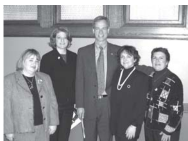
2008 WBCC State Advocacy Day