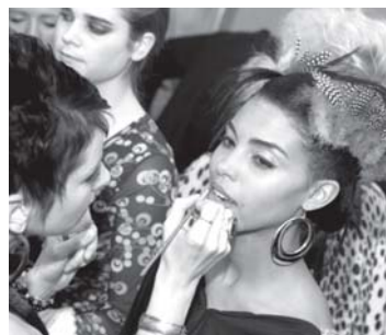
Last minute touch-ups