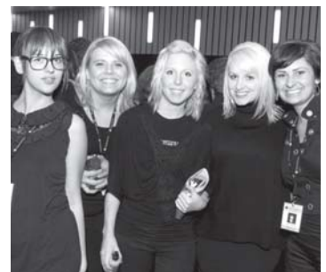
IBW Students enjoying the event