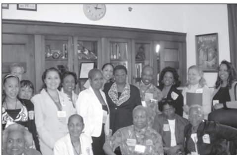
WI delegates meeting with Representative Moore