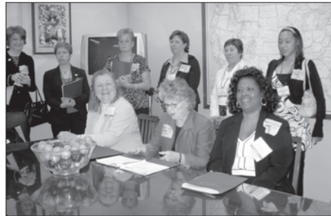
WI delegates during a meeting at Senator Kohl's office