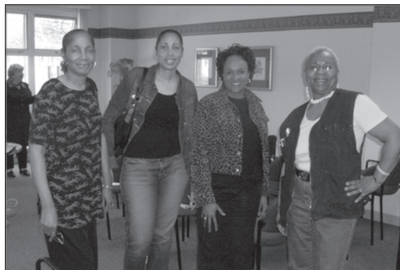
WBCA delegates during a previous Beyond the pink ribbon event preparing for the 2007 trip to Washington, DC.