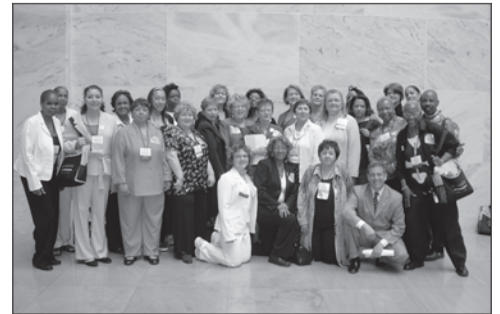
WI delegation with Senator Feingold