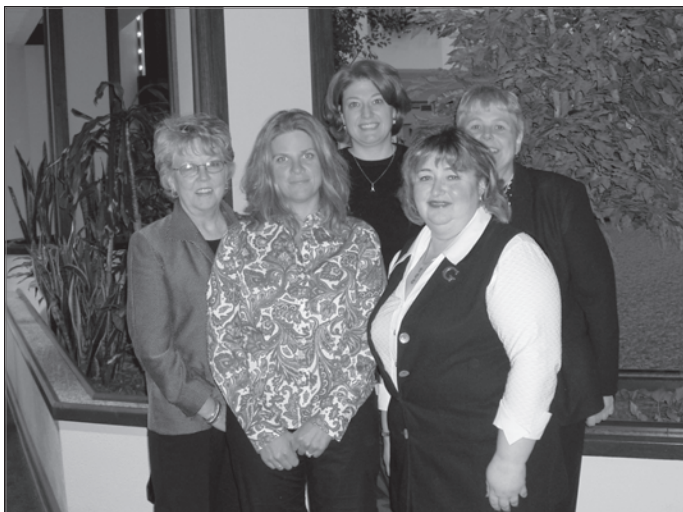
WBCC members who participated in strategic planning and implementation of Wisconsin's Comprehensive Cancer Control Plan.