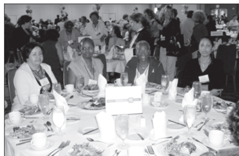
WBCC members at NBCC Conference Dinner