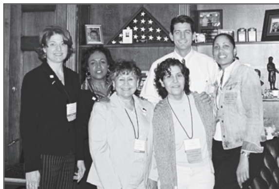
Congressman Ryan with WBCA delegates in 2006.